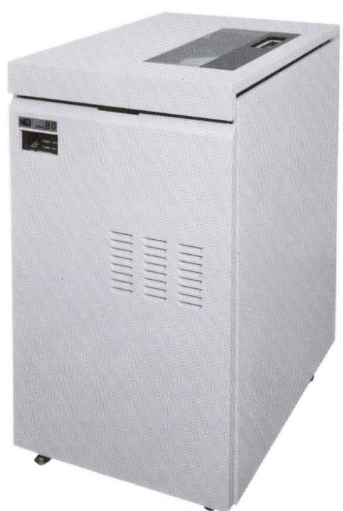
NP80 Stand Alone