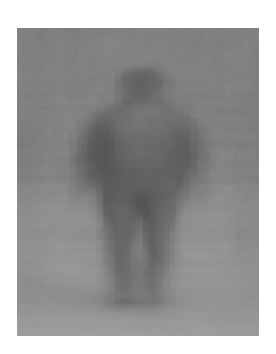
Figure 3: Two typical images of pedestrians and an "average" pedestrian.

images of pedestrians (data used in [5]) and an overcomplete wavelet basis, we solved the "many signals" sparsity problem using the images as signals and the wavelet basis as our overcomplete basis. Following the simple approximation method described in the previous section, we first generated weighted averages of the images of pedestrians (the images were assumed to be aligned, so no correspondece was computed between them before averaging), and then we solved the problem for these averages. Figure 3 shows two typical images of pedestrians as well as a weighted average of 1000 such images. When the average is taken only the "significant" characteristics of the signals remain (ie the shape of a typical pedestrian). After solving (in the sense of [1]) the sparsity problem for this signal, we reconstructed the signal using only some of the found wavelet vectors (thresholding the computed coefficients). Figure 4 shows the reconstructed image using different number of basis vectors (different thresholds). Notice that only a few basis vectors are enough to yield sufficiently "good representation" of pedestrians (similar to the one found in [5]). Further tests need to be done to evaluate the quality of the found representation.