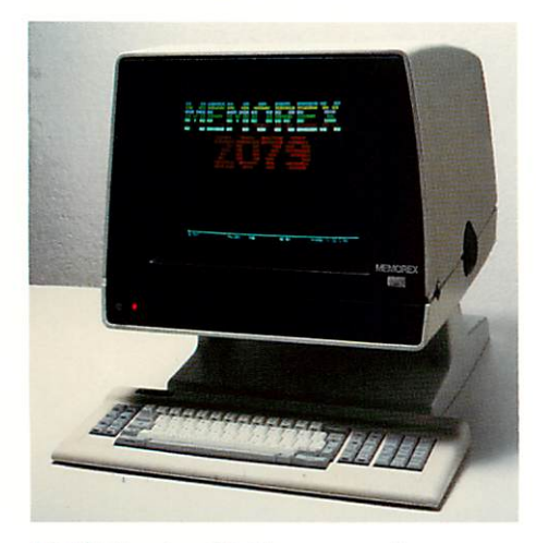
2079 Display Stations are all preconverged, eliminating the need to perform time-consuming convergence routines.

All colors on the 2079 are crisp, clean and in focus from the moment the Display Station is powered on. And there is no need for convergence routines, because all 2079s are preconverged during manufacture.