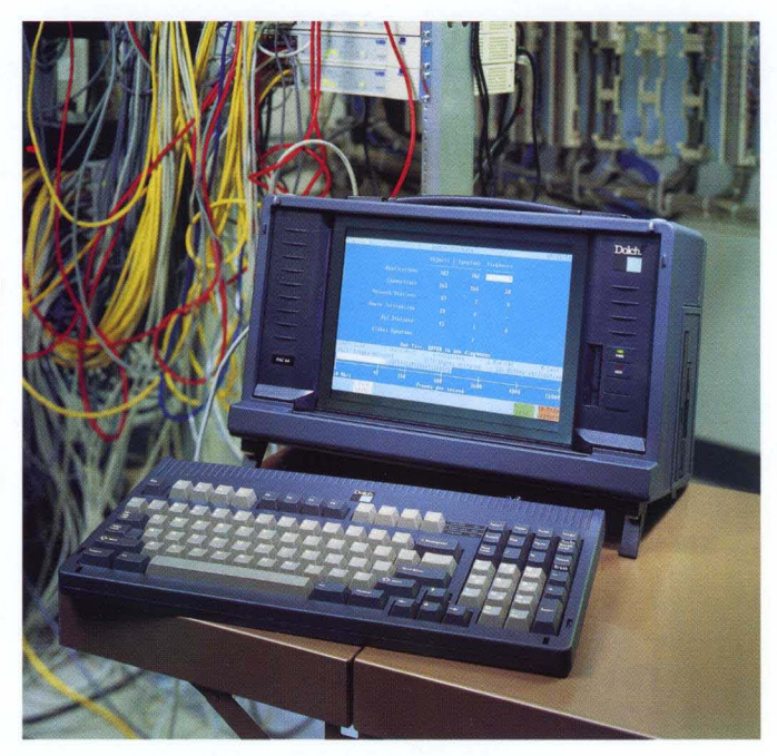
Dolch PAC 63C— Ruggedized Sniffer Platform