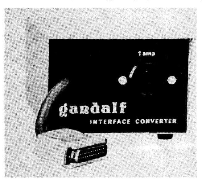
The IFC 200 Interface Converter series was introduced by Gandalf five years ago. All models are available in the one standard size shown above. Prices have not risen since last year's report.

IFC Models 207, 208, and 209 provide RS-232-C to AT&T 300 interfacing. These converters are used with the AT&T Series 300 data sets, which support high-speed transmis-