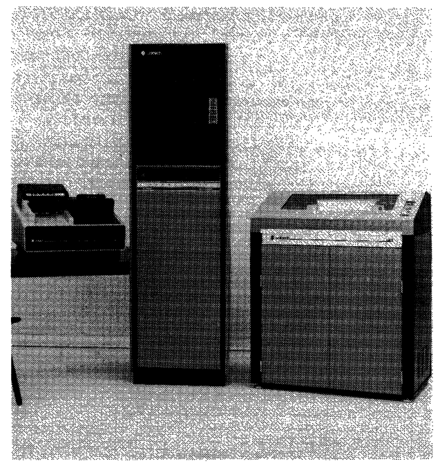
Typical Unitech peripherals include (from left) a card reader, magnetic tape drive (UT-1 and UT-4 only), and line printer. The Data General minicomputer is housed in the central cabinet along with the tape drive.