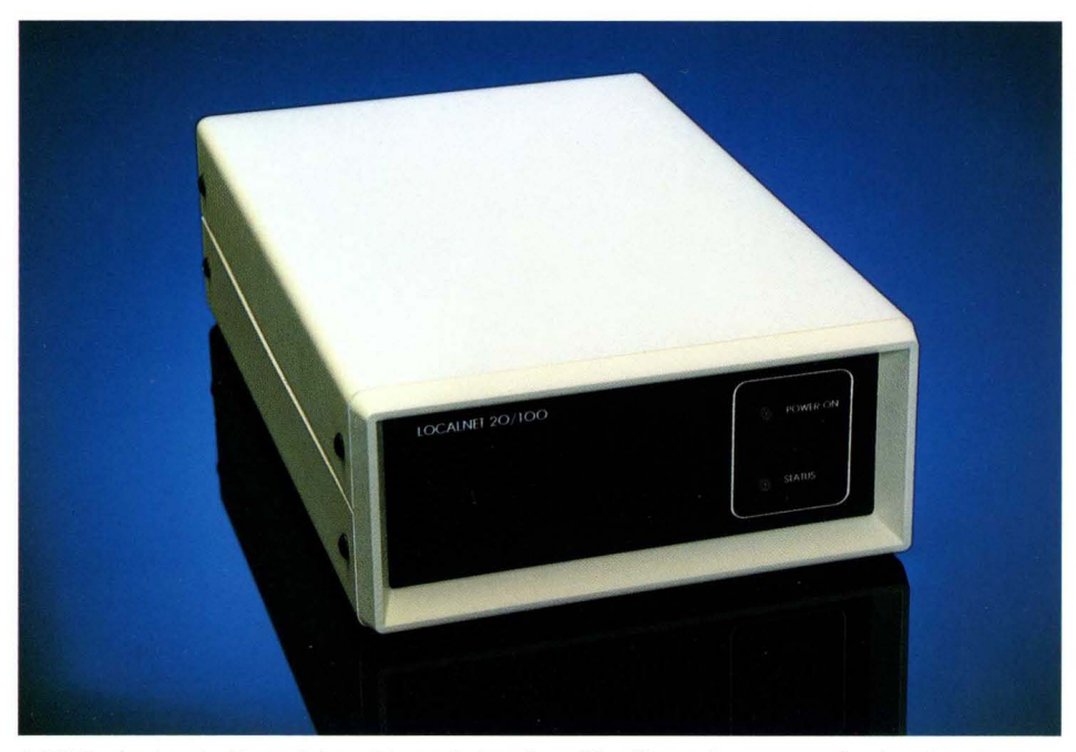
A PCU associated with each LocalNet node handles all intelligent data communications functions.