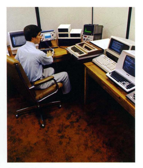
LocalNet is totally vendor-independent, so all the devices you own can communicate with one another.

Cost control is another consideration. For some network technologies, the incremental cost of expansion is very high. With leased lines, for example, you have no way to avoid costly rate increases, or even predict them!