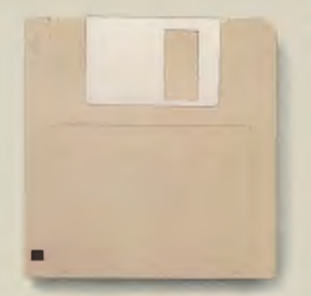
Updates provided on convenient 31/2 ' micro-diskettes.

Staying on the leading edge of technology challenges even the most innovative design engineers. You are continually bombarded with newer and more complex devices such as one-megabit EPROMs, MegaPALS<sup>®</sup>, and PLCC devices. And, the nature of parts is changing as well. For example, programmable ASICs are increasingly used in new design starts.