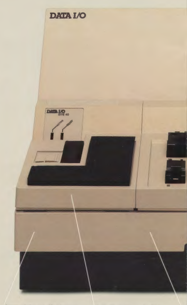
State-of-the-art, 16-bit microprocessor for speed and power

SPEED RECORDS. The UniSite 40 is driven by custom ICs, a high-speed RAM, and a 16-bit microprocessor which ensures that devices are programmed precisely to manufacturers' specifications at record-breaking speed. The UniSite 40 provides the flexibility of universal device support with the performance of a dedicated programmer. For example, EPROM programming and verification speeds rival any production programmer. And functional logic testing includes full high, low, and tristate speeds 10 times faster than any dedicated logic programmer.