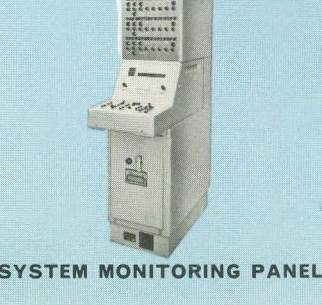
SYSTEM MONITORING PANEL