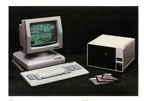
For even more versatility, you can add personal computing capabilities to the 2178 Display Station by connecting a Memorex 2200 Attached Processor.

The benefit of this advanced design is that you can arrange the modules to suit your desktop space. For example, you can place the logic module on your shelf, set the display module in the corner, and put the keyboard on the desk edge nearest your chair. The cabling, from keyboard to display and from display to logic module, enhances this flexibility.