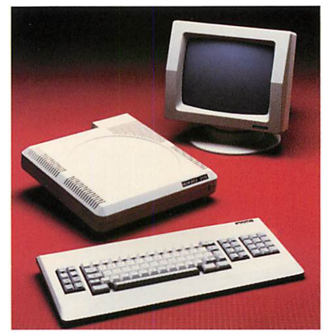
Each module can be easily interchanged and moved around the desktop.

The 2178 is actually a threepart unit, consisting of a display module, a logic module containing the logic and power supply—and a keyboard module.