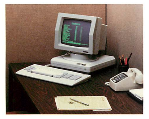
The 2178 saves desktop workspace, provides IBM 3270 compatibility, and offers an extensive package of ergonomic features.

And the 2178 satisfies operators who prefer Memorex's popular user-friendly features, such as ergonomic keyboard, tilt and swivel monitor, and non-glare screen.