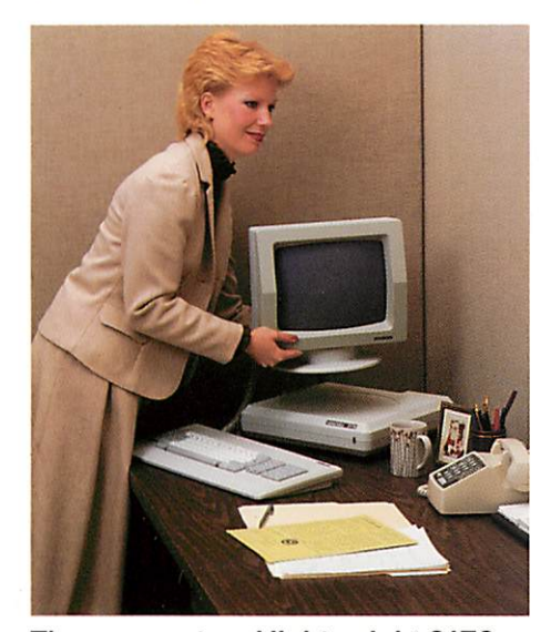
The compact and lightweight 2178 takes up little space on a desktop and is easy to move.

The display module tilts and swivels so you don't have to. You can freely move it 10 degrees up or down, or 45 degrees left or right, to accommodate your line of vision.