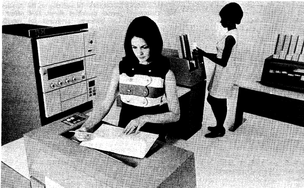
This overall view of a typical System/3 installation shows the 5203 Printer in the foreground, the 5410 Processing Unit at left, and the off-line 5486 Card Sorter at far right.

II program. Auto Report also provides a COPY statement that permits RPG II source statements to be copied from a disk library into source programs that are about to be compiled.