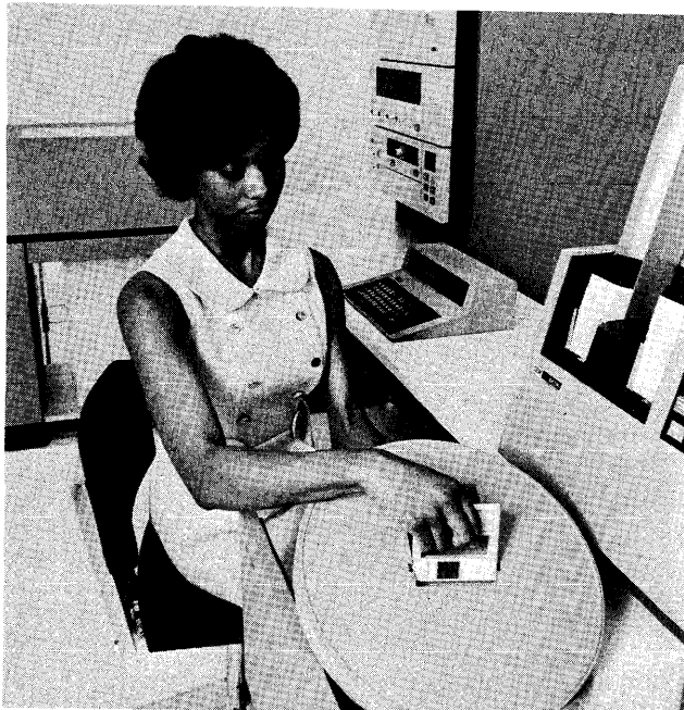
A drawer beneath the 5424 Multi-Function Card Unit houses the compact 5444 Disk Storage Drive and its removable single-disk cartridge.