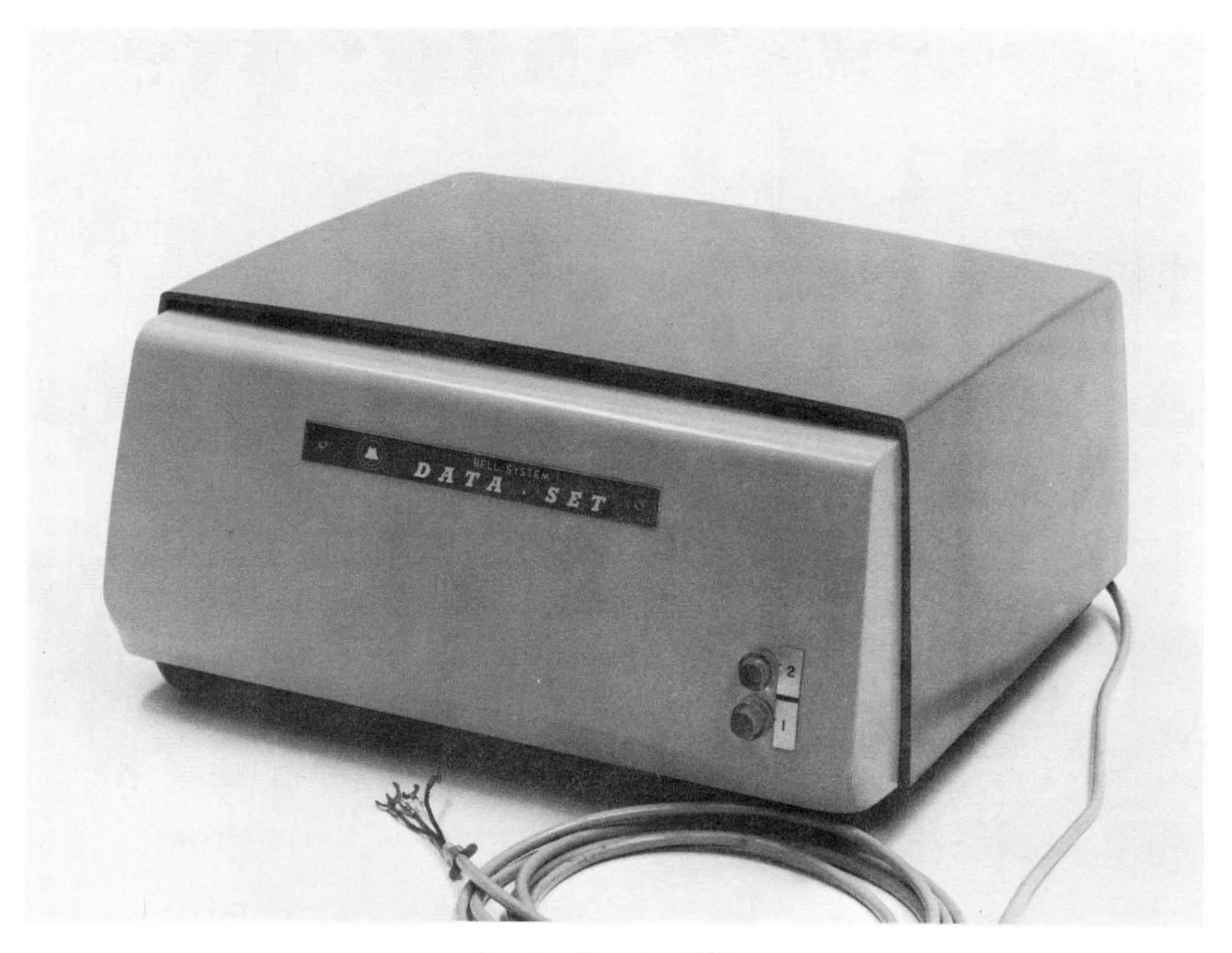
Fig. 1 - Data Set 103F